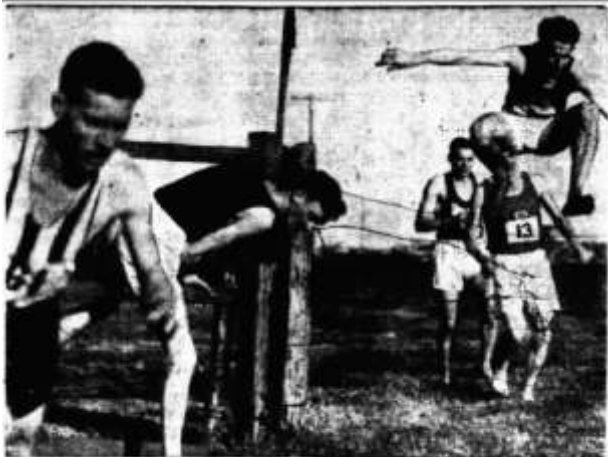
FANCY 10,000 OF THIS! Athletes doing a little fencing in the N.S.W. cross-country 10,000 metres championship. One man seems to be taking part in the high jump, but really it's only his way of getting over the obstacles.