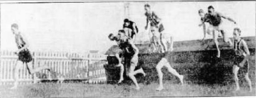
WAS THE BRILLIANT LEADER IN THE FIRST LAP OF THE PERFORMANCE OF THE WINNER IN A SUCCESSFUL LEADING THE FIRST.